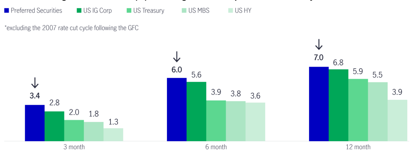
Chart 1: Average market returns (%) following the start of past four rate cut cycles<sup>1</sup>

Conversely, companies in weaker financial positions have faced challenges from elevated refinancing costs when financial conditions have tightened.